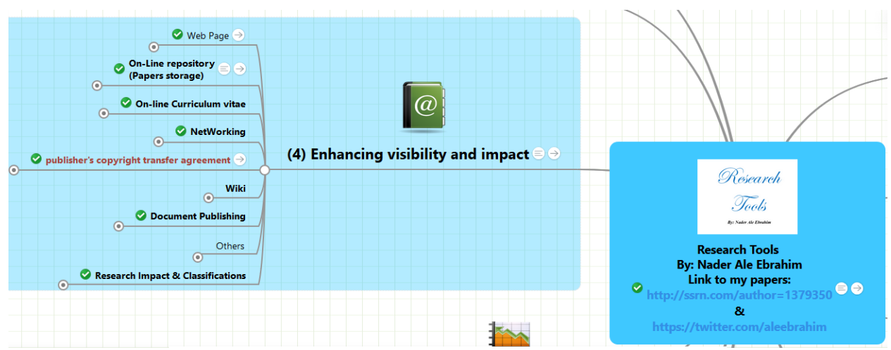
Figure 2 Screenshot of part four "Enhancing Visibility and Impact"

Research impact is important for researchers to improve their research reputation, increase university ranking, and getting grants from funders. As such, dissemination of research findings plays a vital role. These three stages will help researchers to publicize their research output and hence increase their visibility. Further links to effective tools are available online at <a href="http://www.mindmeister.com/39583892/research-tools-by-nader-ale-ebrahim">http://www.mindmeister.com/39583892/research-tools-by-nader-ale-ebrahim</a> part four "Enhancing Visibility and Impact" (Figure 2).